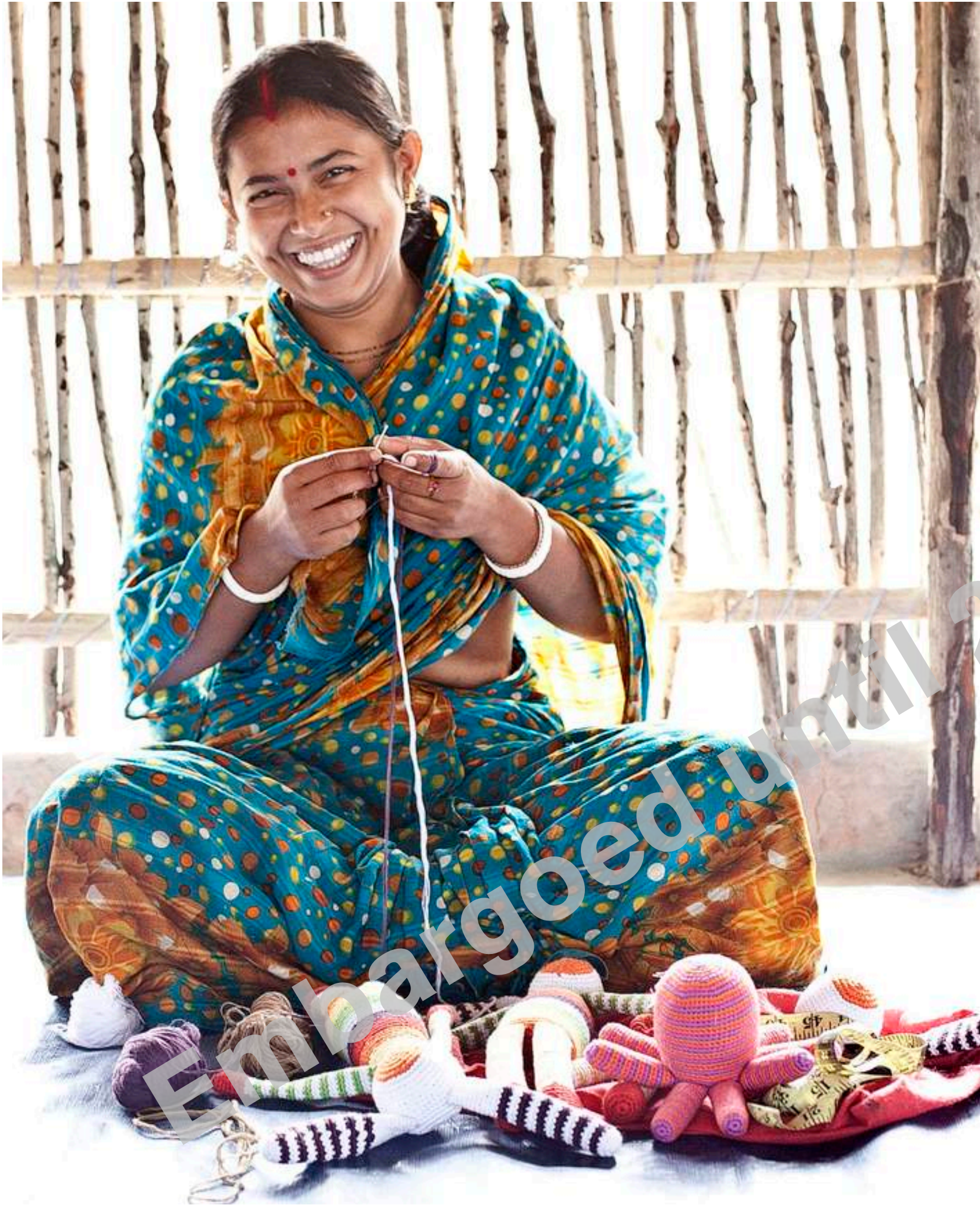
Pebble Hathay Bunano